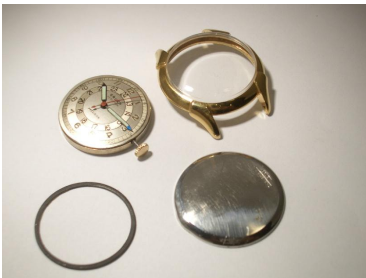
completed project parts before assembling

After we have completed all 3 project parts the assembling of the whole watch stands before. This is the best part of all, and it's a beautiful moment to see when all project parts fits together and a part of watch history was rebuild.