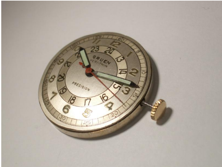
Dial and hands after restoration (mounted on the movement)

The hands was overhauled in our own workshop and new luminous was put onto the hands so they glow in the dark, as they should.